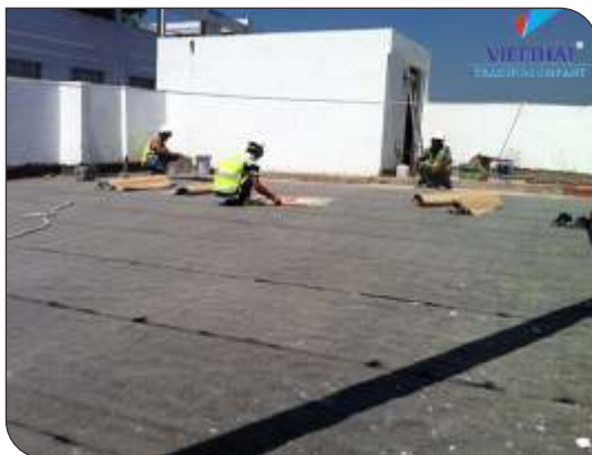
Applying self-adhesive membrane